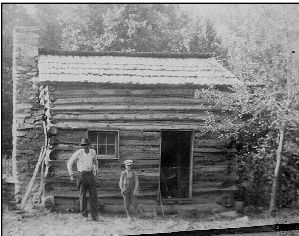
Photos from Scrapbook of Home Demonstration Club, Clifford, VA, 1961, located in the Museum's archives.