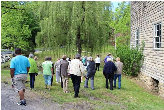
Some of the visitors at Brightwell's Mill head down to the mill pond to see more of the mill property.