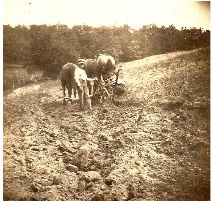
At Pedlar Mills, plowing with horse drawn plows.

*OPA=Office of Price Administration (Established in 1941; discontinued in 1947, when its functions were distributed to other agencies.)